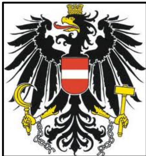
Austrian Coat of Arms (post-1945)