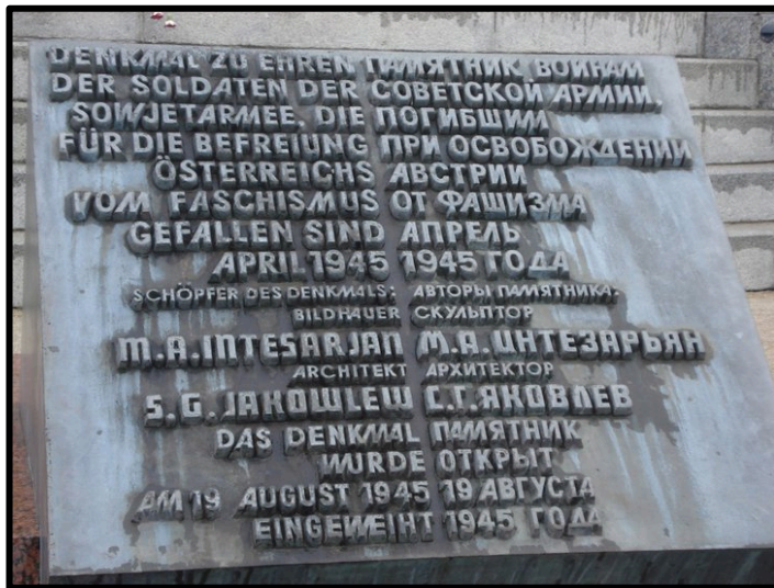
Austrian Memorial to the Soviet Union in Vienna (1945)