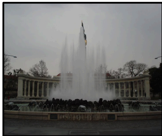
Austrian Memorial to the Soviet Union in Vienna (1945)