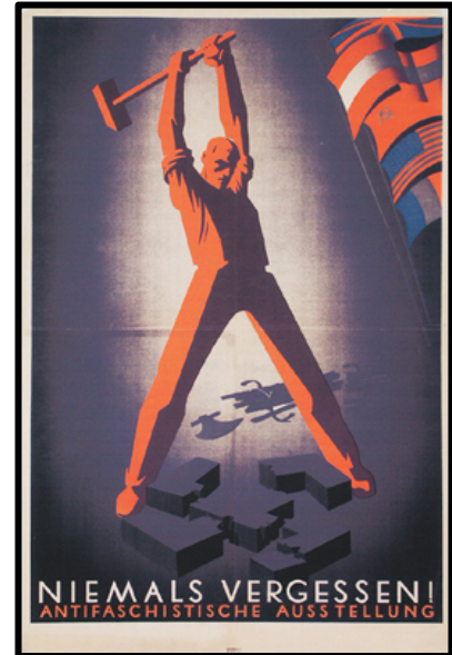
Vienna Künstlerhaus (1946)