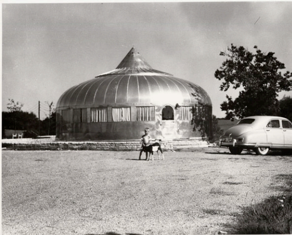
Buckminster Fuller's failure in his 1949 Dymaxion Prefab House Prototype resulted by his pursuit to commodity architecture.

The reluctance to correctly focus their design towards solving a relevant issue soiled their opportunity to exploit their designs, inevitably diminishing the designer and client's desire to pursue prefab in the future. Although prefab's premise promised several rewarding opportunities, almost every architect's attempt to incorporate into mainstream housing system resulted in failure due to their restrictive agendas. 10 Most attempts at prefabrication have failed due to economics, market perceptions, and peculiarities of the home-building industry. Traditional construction methods have long been less expensive than prefab experiments, and perceived by the public as being of higher quality.