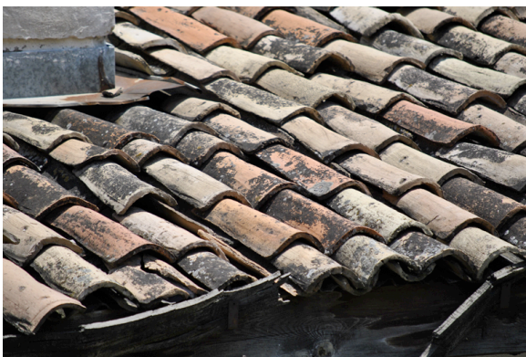
Salvaged Clay Roof Tiling Detail – Safranbolu, Turkey

To many, craft is associated with quality. In most instances, craft within the architectural profession is exactly this. Quality can serve as a measuring stick for craft through comparison of their similar forms. Designers proudly label their products craft as symbolizing their care to its appearance and tactility, however craft is not affected by its aesthetics. The technological world has provided us with a new set of tools and design methodologies, changing our methods of production. Modern craft no longer rests on the abilities of human hands, rather the handling of our materials. Craft generally lies in the making part and every detail in our methods of fabrication defines its value.