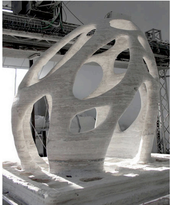
The Radiolaria Pavilion's form is constructed solely by layers of limestone and organic binding solution amalgamated stronger than portland cement.

dimensional printer, conventional materials can now be amalgamated into unconventional forms using methods once unpractical or unattainable by prior technologies. 18