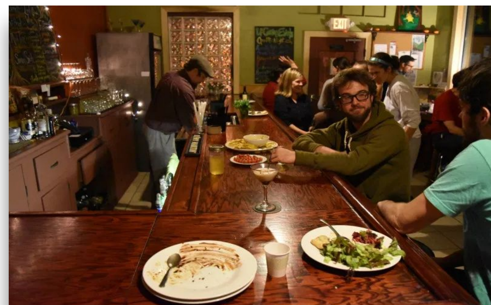
Figure 5: Common Roots Pub

Urban Earth Farms operates out of a florist's greenhouse which was acquired in 2009. The community manages a community-sustained agriculture project out of the facility.