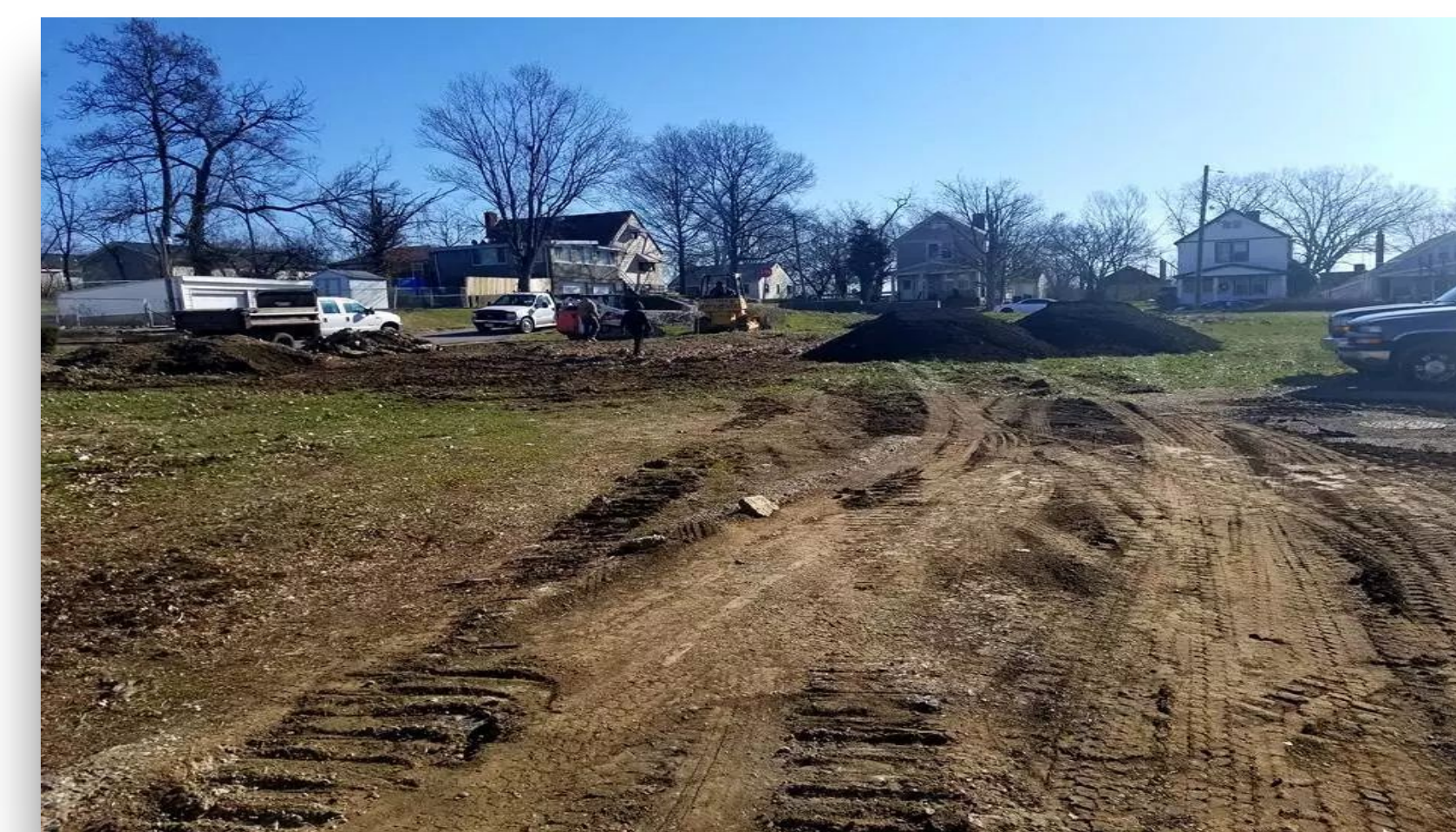
Figure 3: Ice House Property Park

In the early 2000s, Paradise Lounge was notorious for nightlife and drug related violence. The ERUEV community viewed this establishment as blight in their community.