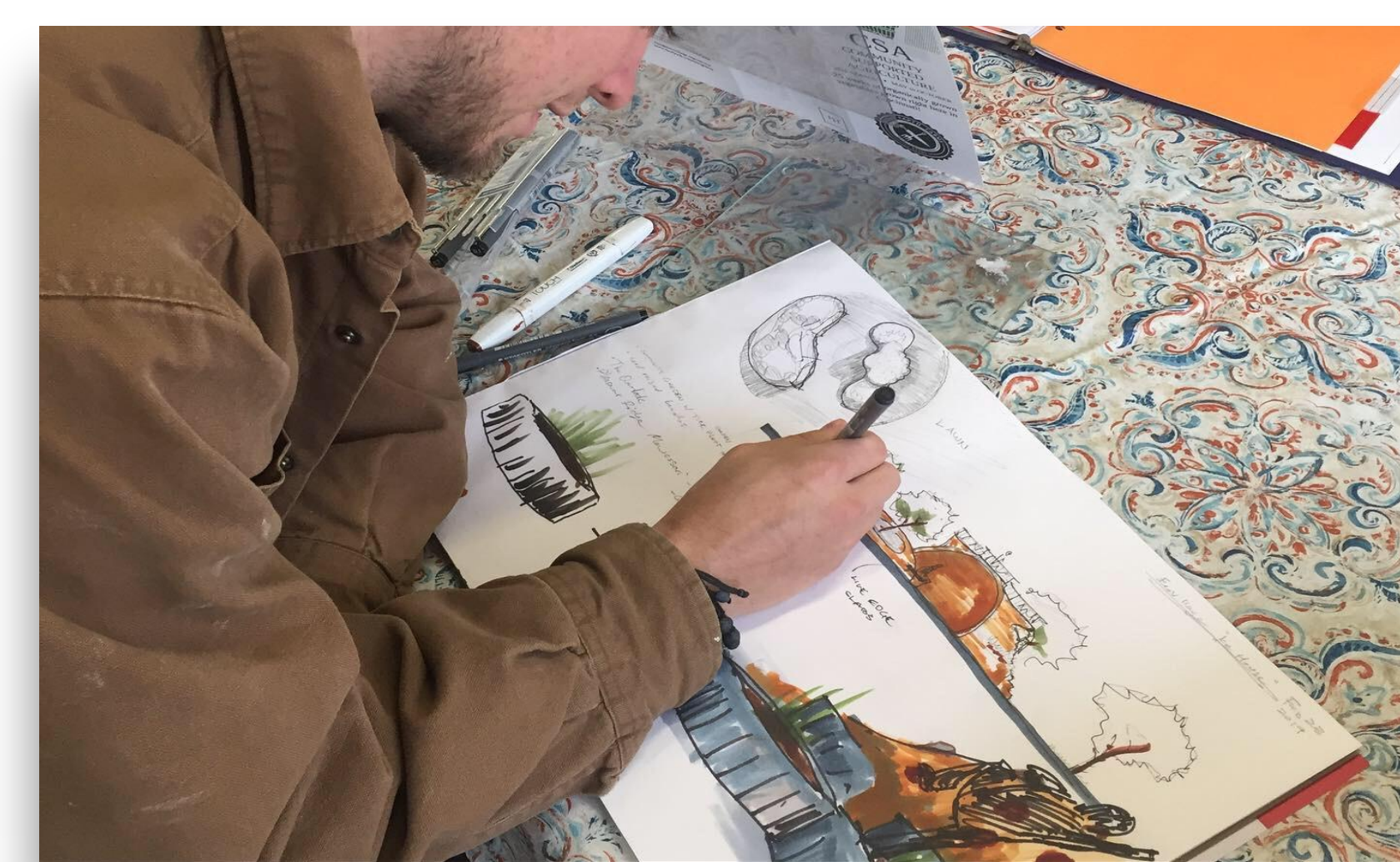
Figure 6: Community Based Design

Common Roots Pub, formerly Paradise Lounge, is a hub of social activity for the community hosting weekly potlucks, guest speakers, open mic nights, and various ERUEV events.