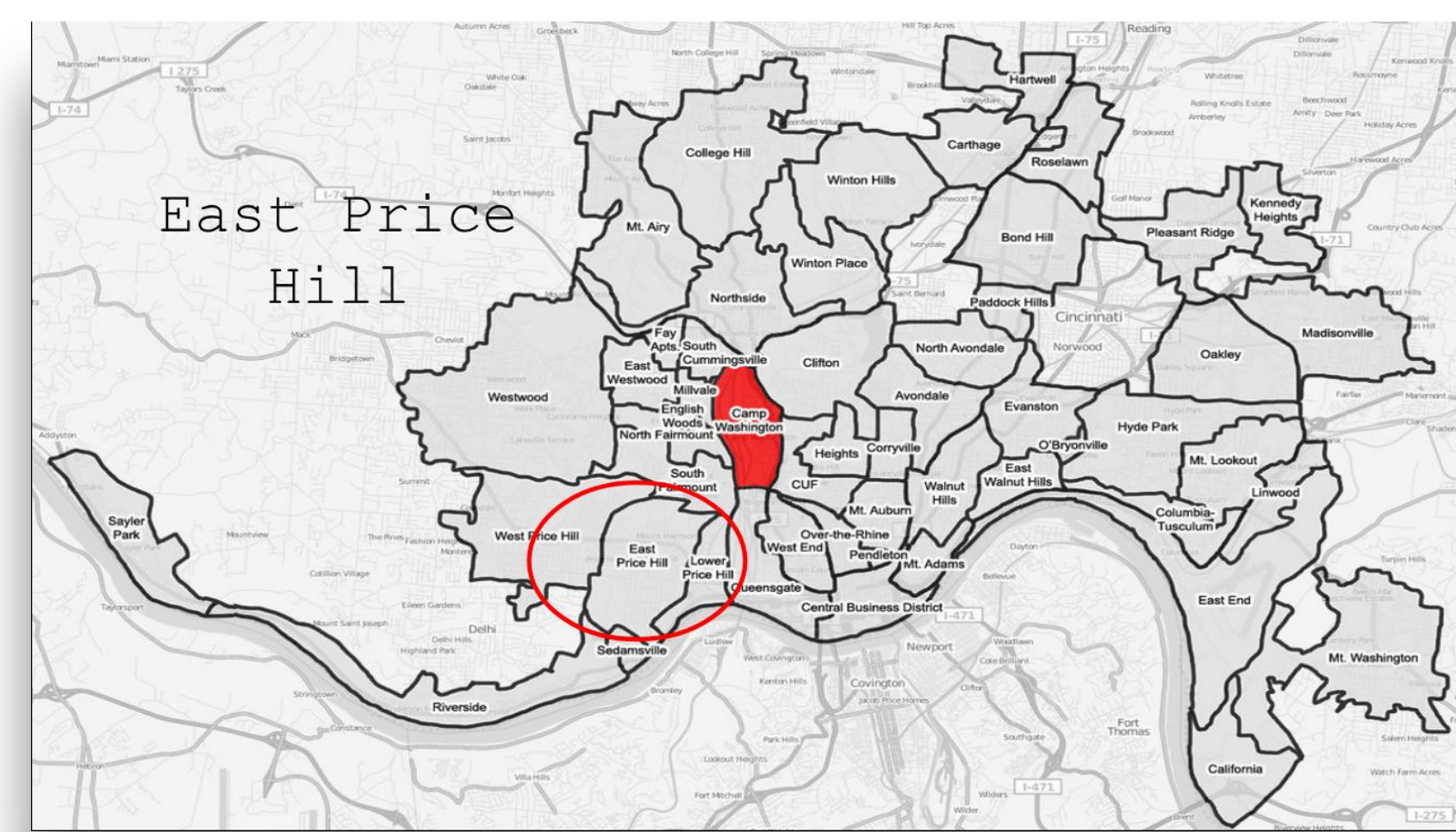
Figure 1: East Price Hill

Research supported by the Department of Anthropology and the College of Arts and Science Dean's Scholar Award at Miami University, the Enright Ridge Urban Ecovillage Community.