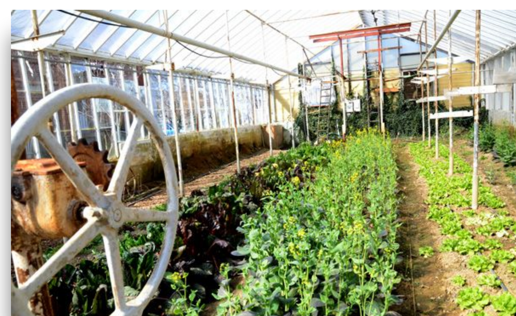
Figure 4: Urban Earth Farms

The Ice House Property has been vacant for over forty years and is seen as blight. The ERUEV community is currently organizing to develop this property into a community park.