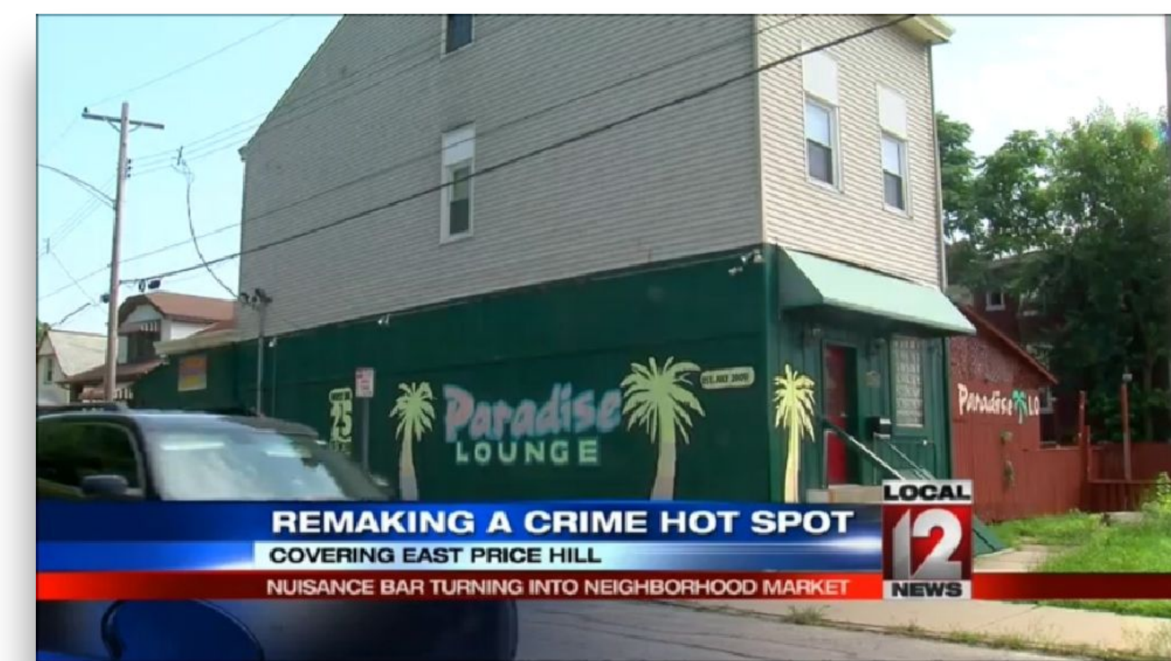
Figure 2: Paradise Lounge

The map highlights the East Price Hill neighborhood of Cincinnati, OH. The Enright Ridge Urban Ecovillage is located in a one mile radius of Enright Ridge Ave & 8th St.