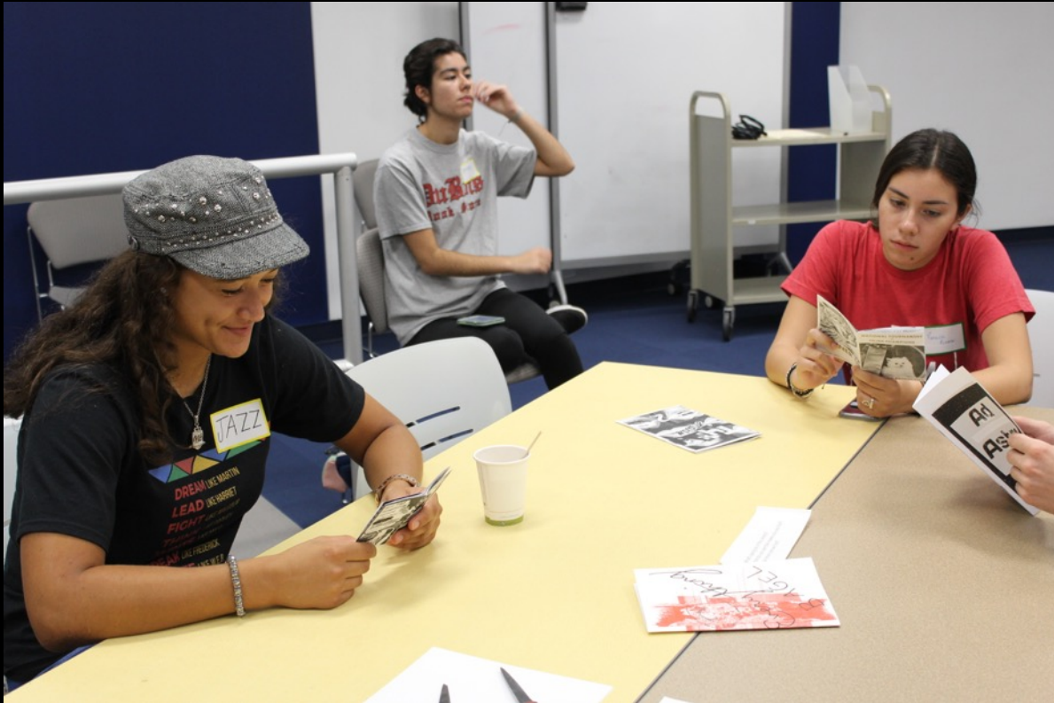
Students interacting with the zine archive