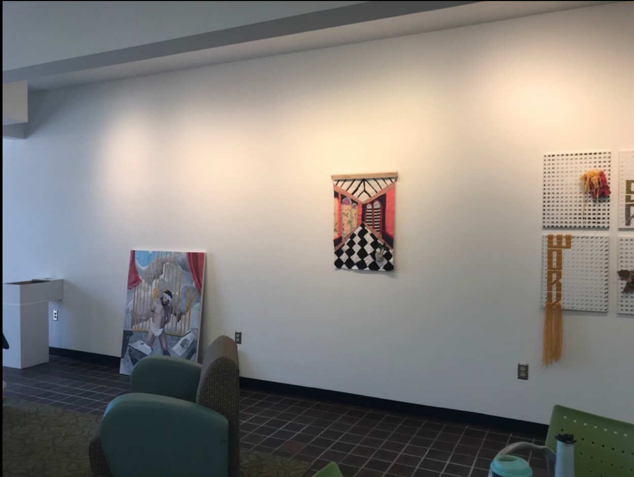
L to R: Gabrielle Roach, Wobbly , acrylic and oil on canvas, 8.25" x 5.5" 36" x 48", 2018; Casey Dressell, Amazing , collaged fabric and wood, 21.5" x 31.5", 2018; Ashley Carroll, Untitled , mixed media, 4 16" x 20" panels, 2018