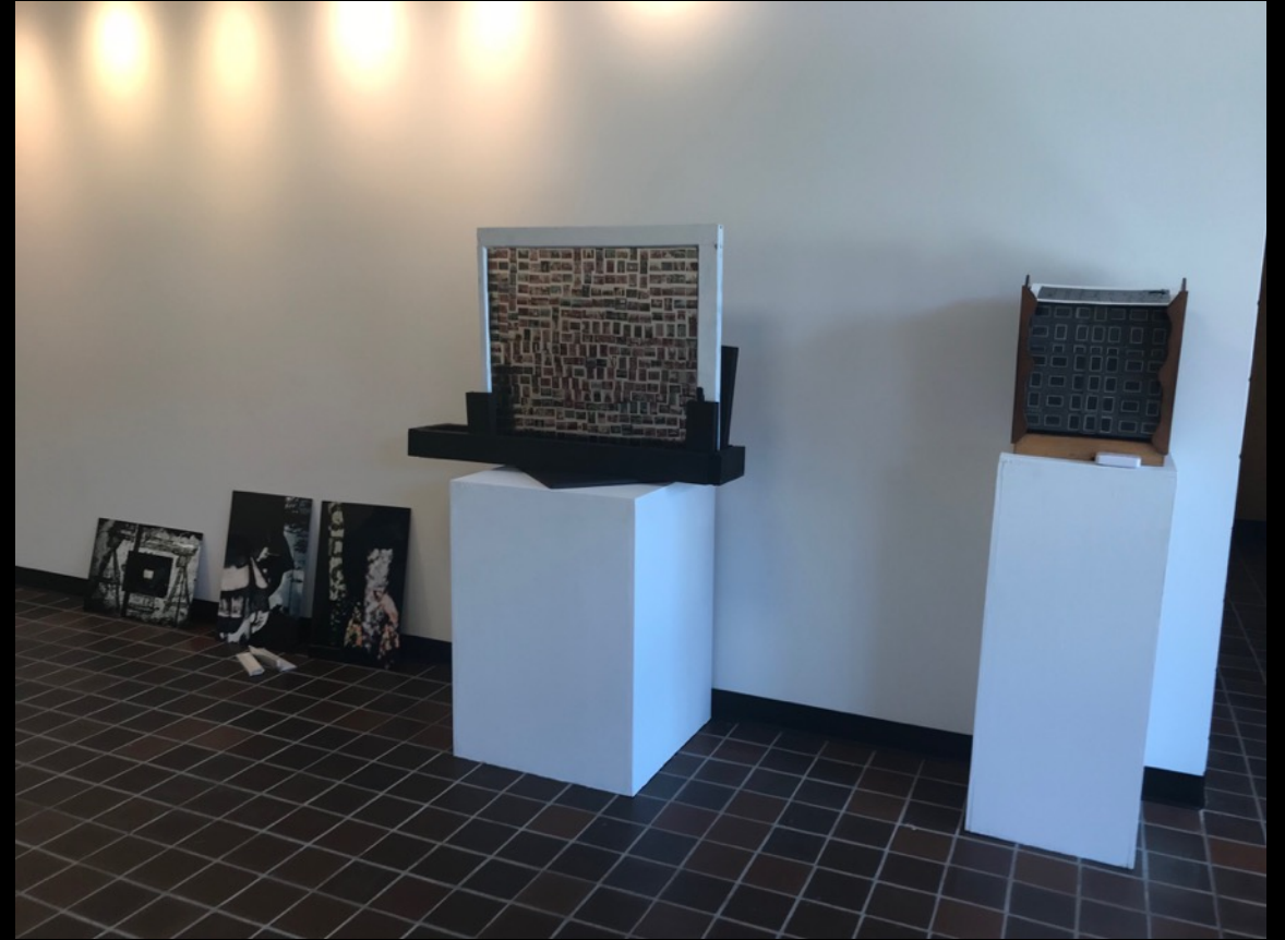
L to R: cris cheek, Untitled , digital photographs mounted on metal, 3 16" x 20" panels, 2018 Zackary "Blade" Hill, Tiny Architecture , found objects, glue, and plastic, 36" x 34" x 6", 2018 Zackary "Blade" Hill, Small Shadows , wood, slides, metal wire, LED string, glue, foam, 15" x 18" x 11", 2018