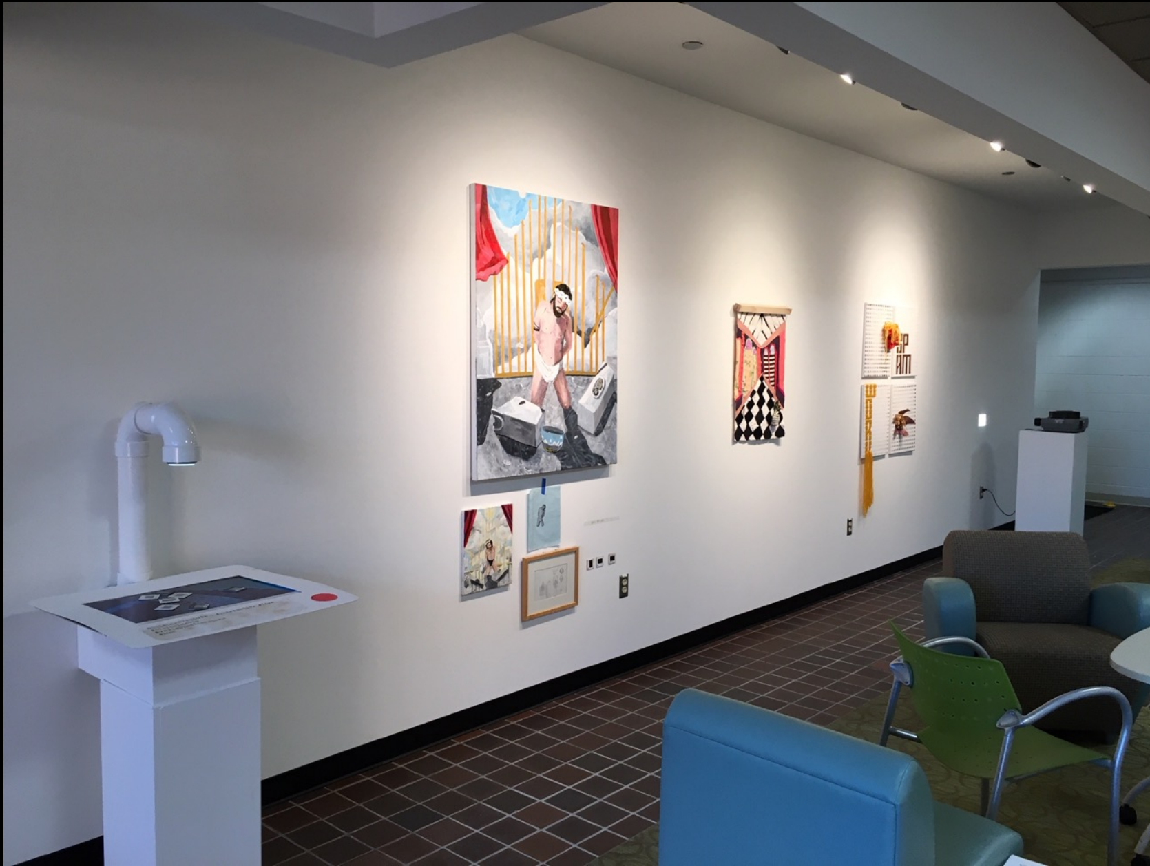
L to R: Geoff Riggle, Untitled , mixed media, variable dimensions, 2018, Gabrielle Roach, Wobbly , acrylic and oil on canvas, 8.25" x 5.5" 36" x 48", 2018; Casey Dressell, Amazing , collaged fabric and wood, 21.5" x 31.5", 2018; Ashley Carroll, Untitled , mixed media, 4 16" x 20" panels, 2018; Billy Simms, Untitled slides, slide projector, and watercolor paint, variable dimensions, 2018