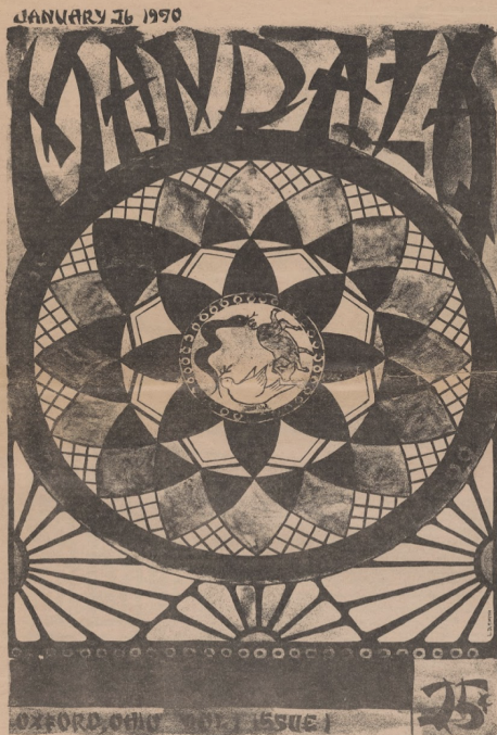
Mandala Issues 1,2,3 1970

"It is the inherent right and responsibility of the white man to protect himself and his family from the murders, rapists, and revolutionaires that presently threaten his way of life."