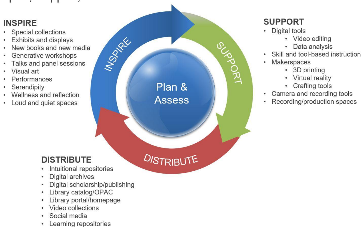
Figure 3: The Inspire–Support–Distribute Cycle

In this model, activities such as creative workshops, exhibits, performances, and many archival and special collections instruction sessions (for example, those incorporating what has been called a wunderkammer element), as well as collections, could be classed as services that serve to inspire creative activity. 91 Likewise, library efforts to provide tools, space, instruction, and time for creating digital and material objects, whether such efforts take the form of makerspaces, digital tools, loaned equipment, or support for data analytics or video production, could be categorized as services that facilitate creativity. When libraries publish or showcase creative work (for example, in institutional repositories or via open-publishing initiatives) and cultivate conversations about the work produced by members of their communities, they are distributing creative outputs back into the community, serving to foster new creative inspiration, in a virtuous cycle.