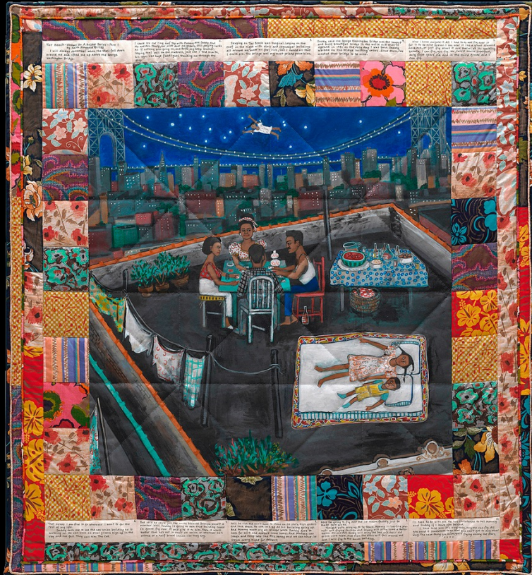
Faith Ringgold Woman on a Bridge #1 of 5: Tar Beach Acrylic paint, canvas, printed fabric, ink, and thread 1988