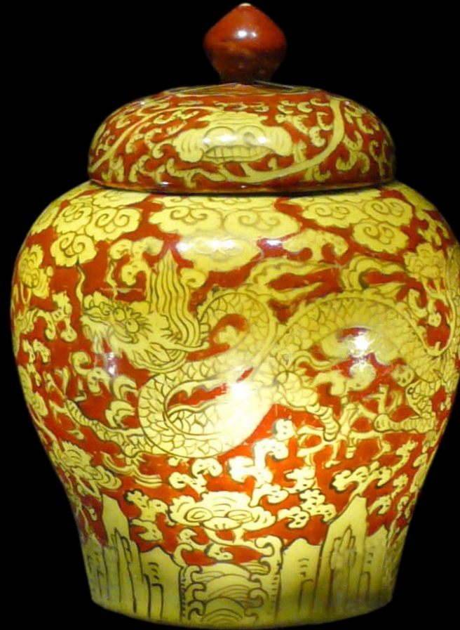
Covered red jar with dragon and sea design Jiajing period 1521–1567 Ming dynasty

https://en.wikipedia.org/wiki/Portrait_of_a_Man_in_Red_Chalk#/media/File:Leonardo_da_Vinci_-_presumed_self-portrait_-_WGA12798.jpg