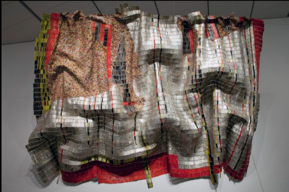
El Anatsui Rain Has No Father? Found bottle caps and copper wire 2008