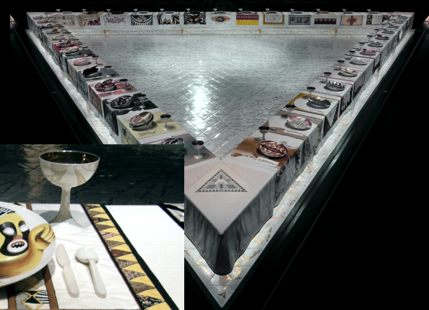
Judy Chicago The Dinner Party Ceramic, porcelain, textile 1974-79