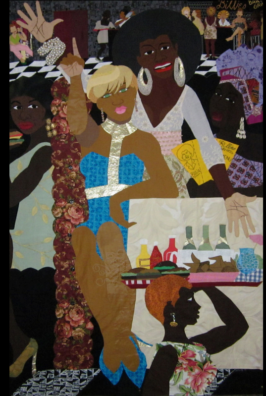
Dawn Williams Boyd "I am Not Your Negro" Assorted fabrics. Beads, sequins, cowrie shells, metal filigree, buttons 2013 https://www.dawnwilliamsboyd.com/ladies-night-series

https://mymodernmet.com/bisa-butler-contemporary-quilting/