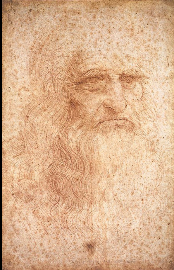
Leonardo da Vinci Self-Portrait Red chalk on paper c. 1512

https://en.wikipedia.org/wiki/Portrait_of_a_Man_in_Red_Chalk#/media/File:Leonardo_da_Vinci_-_presumed_self-portrait_-_WGA12798.jpg