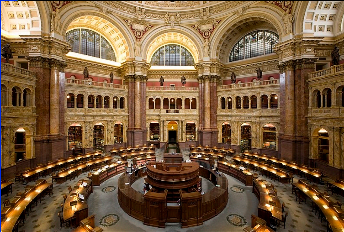
Library of Congress Reading Room